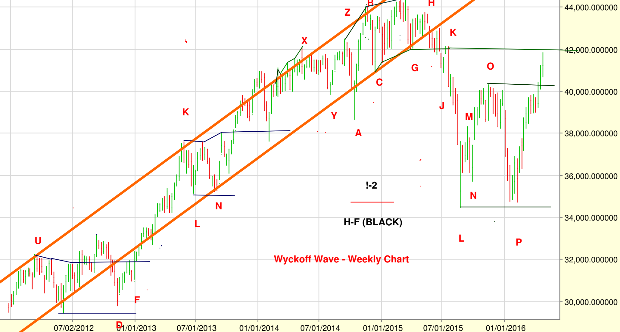
Wyckoff Wave - Weekly Chart

WYCKOFF WAVE [Open: 41,078.730469 High: 41,841.515625 Low: 40,691.250000 Close: 41,242.191406] (+0.22%)